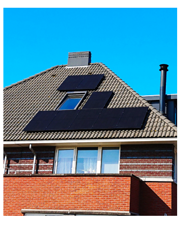
The southeast side of the house includes eight modules around a skylight.