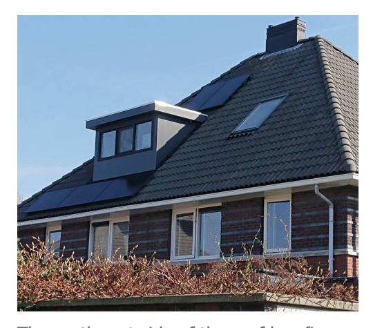
The northwest side of the roof has five modules with one pop-out and one skylight to design around.