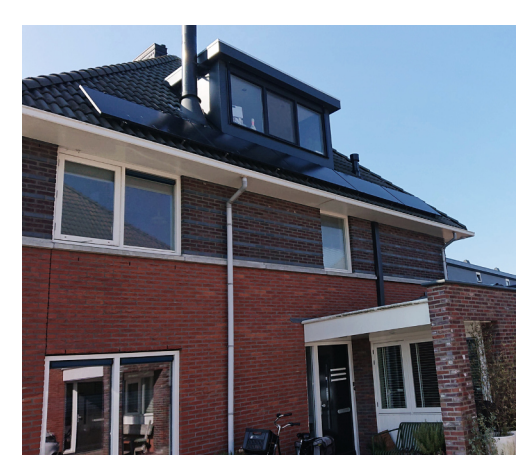
The northeast side of the roof has six modules below a pop-out and multiple roof obstructions